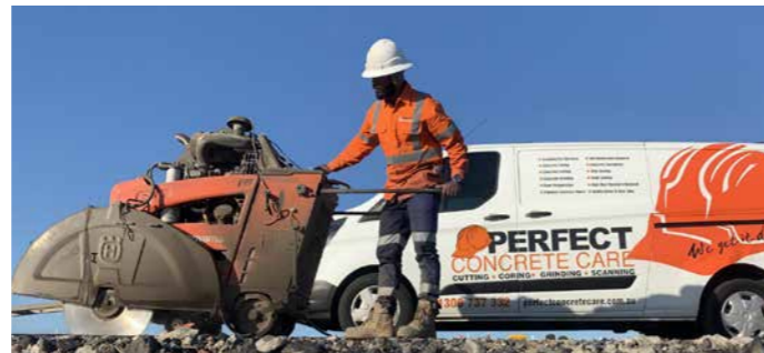
All prices are excluding GST and are subject to change without notice.

Push Saw Surcharge: When the operator is required to work in small/difficult areas which the large road saw will not fit