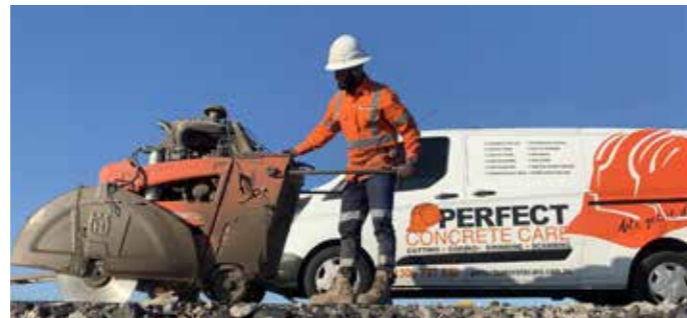
All prices are excluding GST and are subject to change without notice.

Push Saw Surcharge: When the operator is required to work in small/difficult areas which the large road saw will not fit