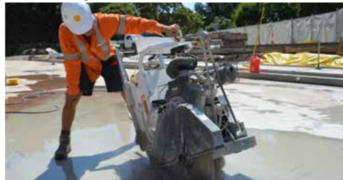
All prices are excluding GST and are subject to change without notice.

Push Saw Surcharge: When the operator is required to work in small/difficult areas which the large road saw will not fit